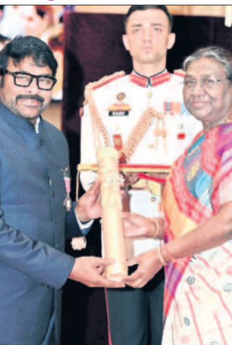
అవార్డుల ప్రధానోత్సవంలో మిగిలిన 67 మందికి పురస్కారాలు అందజేశారు. వారిలో పద్మవిభూషణ్ విభూషణ్ పాటు మోగస్తాల్ చిరంజీవి, మాజీ ఉపరాష్ట్రపతి ఎం. వెంకయ్య నాయుడు ఉన్నారు...